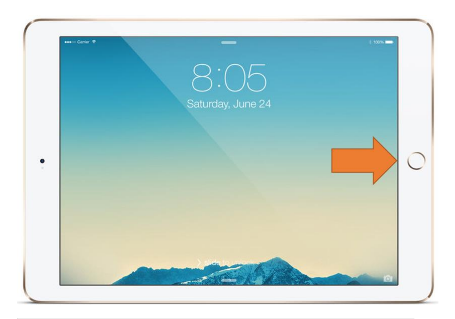
Fig. 1 Above Fig. 2 Below